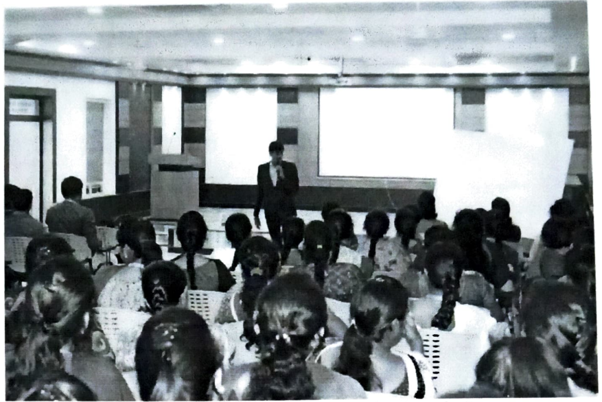
Resource person introducing himself with student